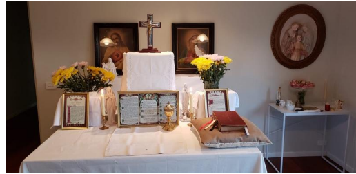
Makeshift altar 'Down Under' in Australia!