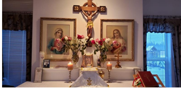
Beautiful altar above the fireplace in Bay Tree, Alberta, Canada.