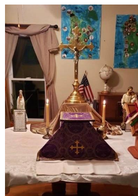
Home Altars in the Nicholville, NY area!