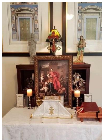
The impressive image of St. Martin of Tour adorns this home Altar in Raleigh, NC!