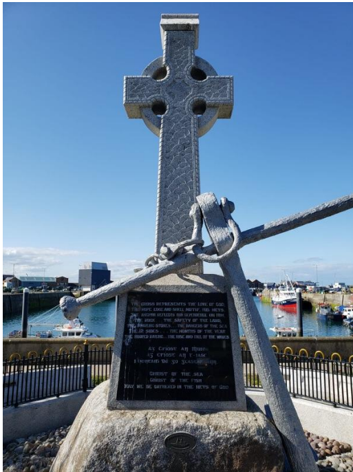
Christ of the Sea Christ of the Nets May We be Gathered in the Nets of God!