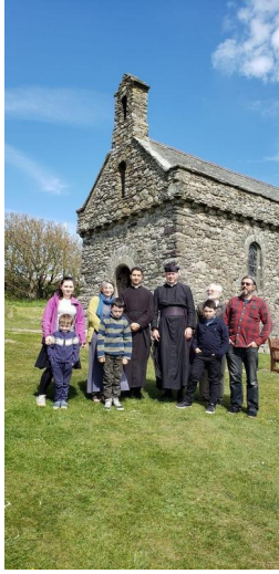
Chapel of Our Lady and St. Non, mother of St. David. He is the Patron Saint of Wales