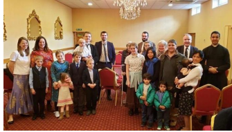
More of the Resistance Laity!