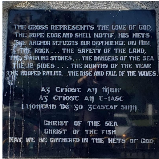
The Cross represents the Love of God, The Rope Edge and Shell Motif, His Nets. The Anchor reflects our dependence on Him, The Rock ...the Safety of the Land, The Sparkling Stones ...the dangers of the Sea, The 12 Sides ...the Months of the Year, The Hooped Railing...the Rise and Fall of the Waves.