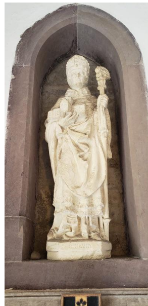
St. David was a 6th Century bishop and is the Patron Saint of Wales. He founded several monasteries in Wales, and fought against the Pelagianism heresy at that time.