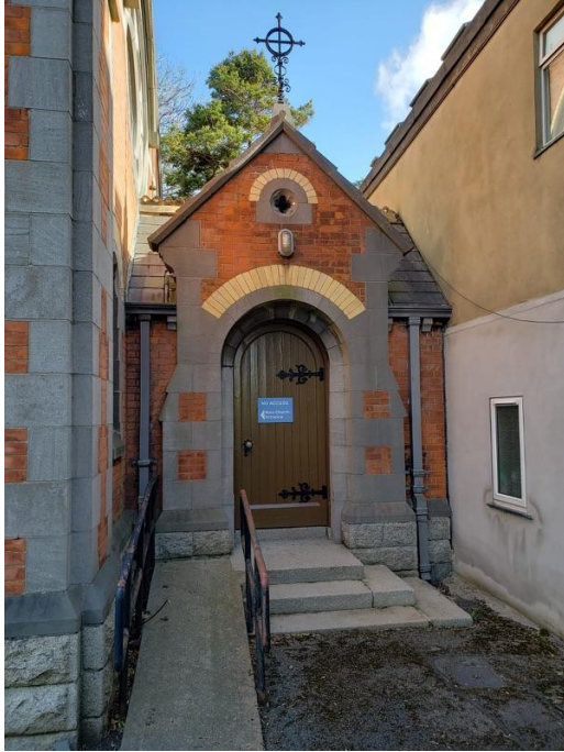
St. Joseph's Church in Dublin