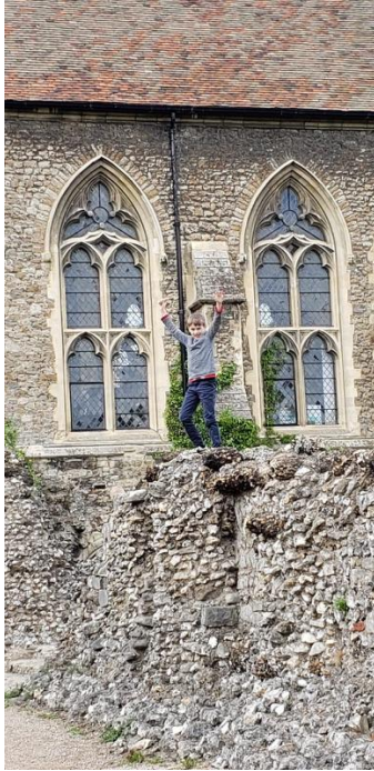
A young Catholic Resistance fighter stands on the ruins of the monastery walls once dividing the cloister and the refectory. The grounds and the stones were all stolen by the Protestants to build their estates.