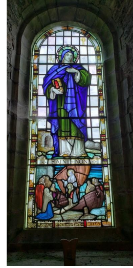
The Chapel of St. Non was built on the site of the birth of St. David.