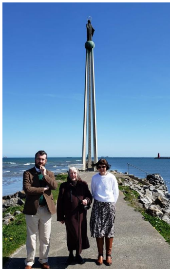
Some of the Resistance Faithful in Dublin Harbor