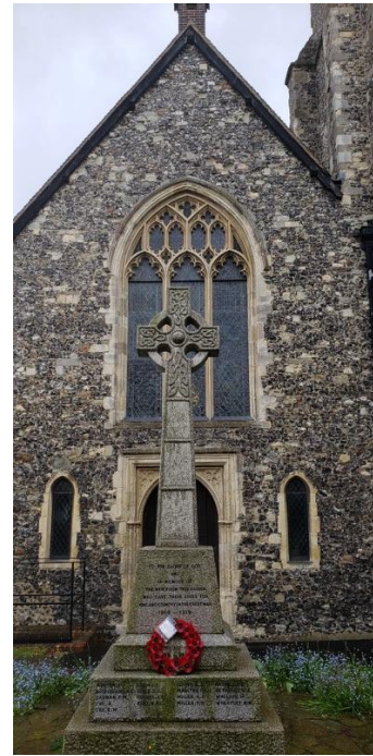
The Church of St. Dunstan, which holds the head of St. Thomas More.