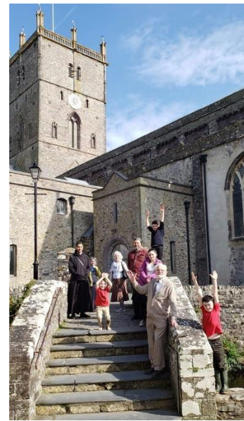
What joy our Catholic heritage brings!