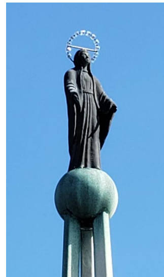
Our Lady guiding ships into Dublin Harbor - The Star of the Sea!