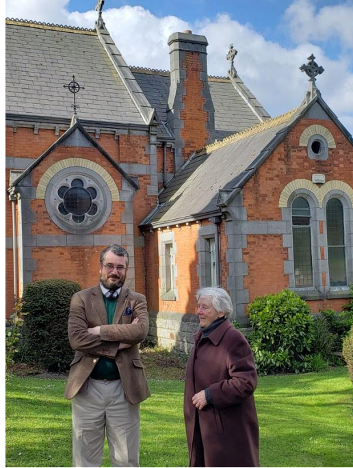
St. Joseph's Church in Dublin